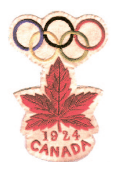
1924 Canadian Olympic patch

The Yachting World & Marine Motor Journal